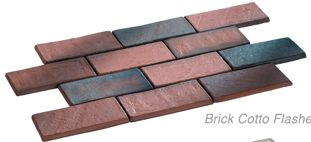
Brick Cotto Flashed