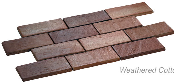
Weathered Cotto Unflashed