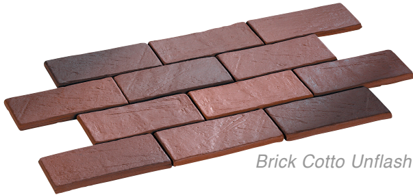
Brick Cotto Unflashed

From America, Ohio craftsmen have developed the most unique real clay terracotta available - an authentic unglazed tile with a rich centuries-old appearance. Hands-on craftsmanship, combined with the “soaking” and “flashing” of Seneca Tiles turn-of-the-century beehive kilns, produces authenticity, character, charm and unique originality. SenecaCotto has the worn and weathered texture found only in a truly handmade product made centuries ago.