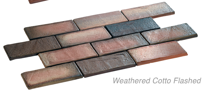
Weathered Cotto Flashed