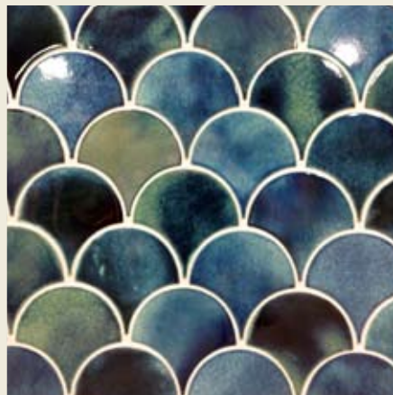
Quarry Paver Aquarium Blend